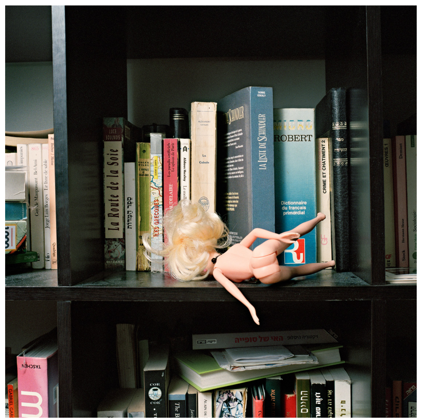
The Book of Attributes Yael Ben-Zion © All Rights Reserved.

All images were made in Israel using a mediumformat film camera between 2004 and 2008. And although more than a decade has passed since they were made, not much has changed. If anything, life just got more complicated.