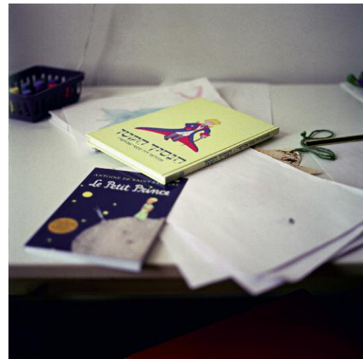
The little Prince © YAEL BEN-ZION