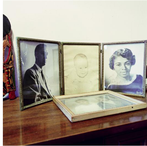
Frames © YAEL BEN-ZION