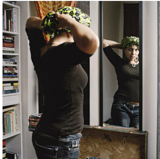
Passing © YAEL BEN-ZION