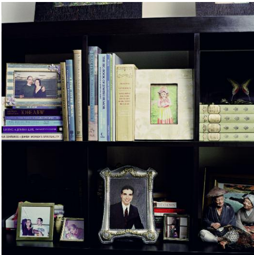
To be a Jew © YAEL BEN-ZION