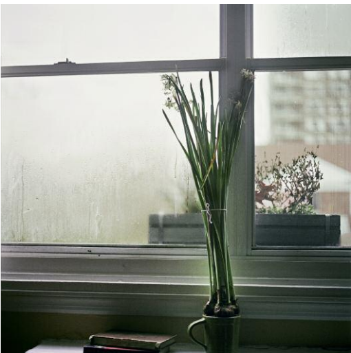
Bulbs © YAEL BEN-ZION