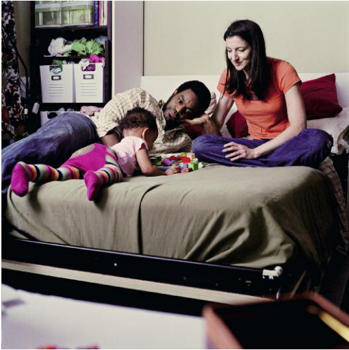
Murphy bed