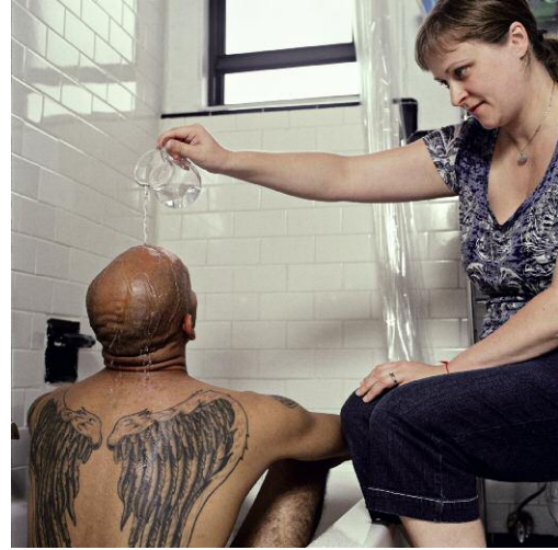
Baptism © YAEL BEN-ZION