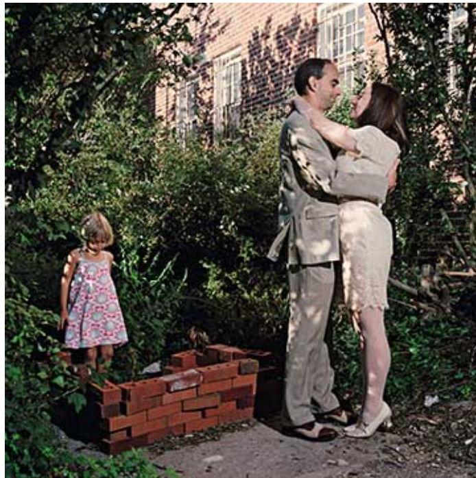
"West Side Story"