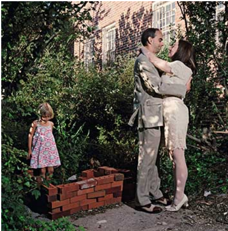
"West Side Story"